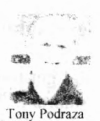
CoCo~123 - A Glenside Publication Since 1985