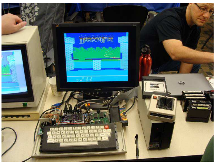
Brendan Donahe's 6847 VDG-to-VGA converter