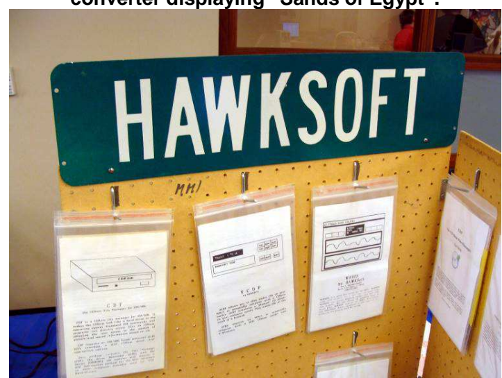
Software for sale – CDF, VCDP, DOMINATION, SOX, GNOP, WAVES, ICON BASIC09, RGB to CV04 CBL. HAWKSoft HOME CONTROL