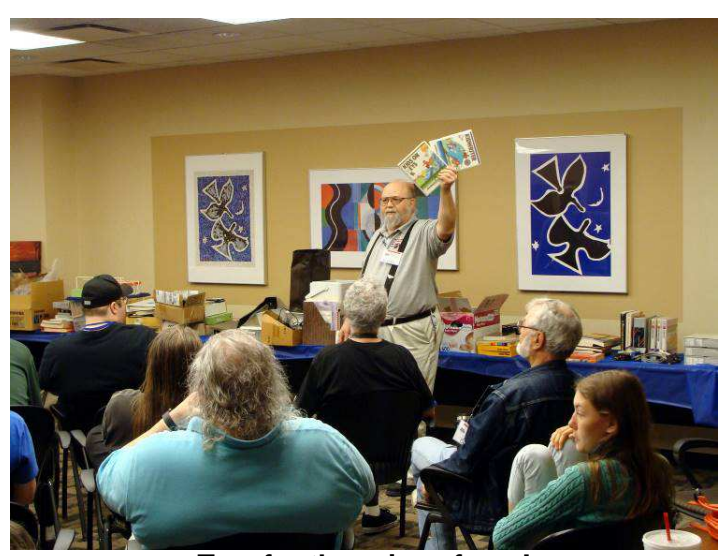
Two for the price of one!