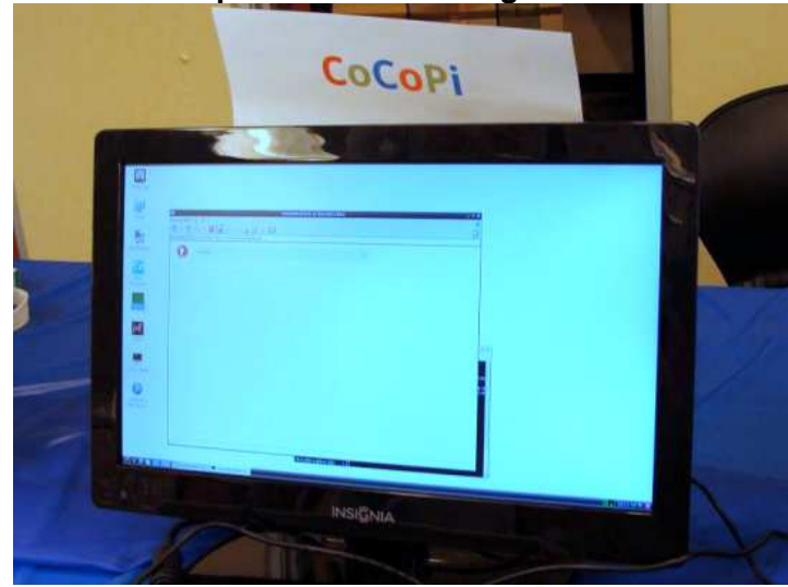
CoCoPi is a Raspberry Pi running Linux, set up to emulate a CoCo.