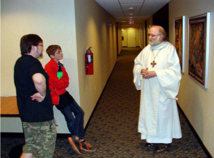
Well, first let me say I am an Episcopal monk and I like computers. Now to your question "Will there be computers in Heaven?". The Bible says: "No eye has seen, no ear has heard, no heart has imagined, what God has prepared for those who love Him."