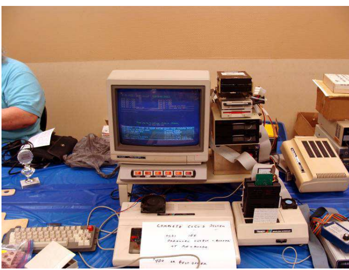
Entire Computer setup for sale by Wally Grossman