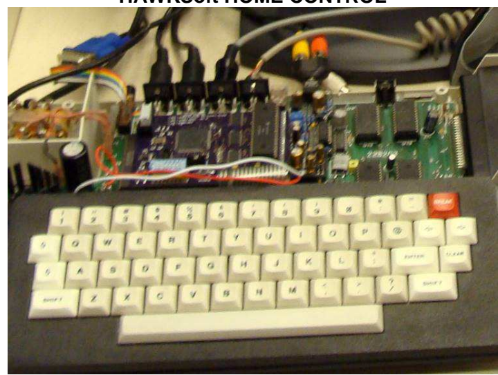
Brendan Donahe's 6847 VDG-to-VGA converter