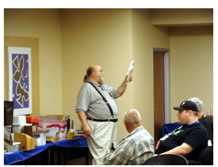
Can I get 50 cents? A dollar! Going once...