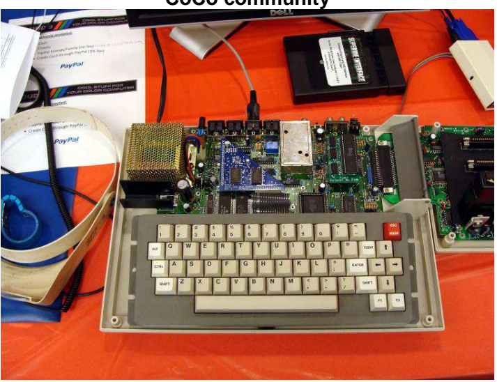
A souped-up CoCo3