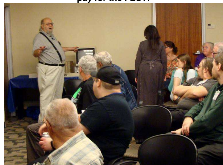
You know you want this!