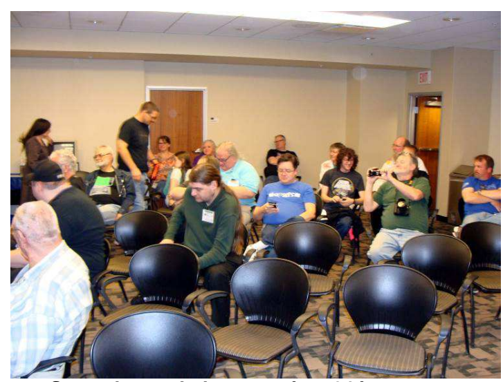
Several attended our auction. 64 items were auctioned Saturday, 39 more on Sunday.