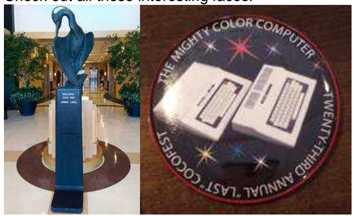
Welcome to our fest.

Our last issue had plenty of information about what was going on at our 2014 CoCoFEST! but that was only half of it. We spend so much of our time at meetings during the year that it seems appropriate to show more of what went on at the fest. We do have a great time putting it on. This half is about the socializing that goes on much of the time. Check out all these interesting faces.