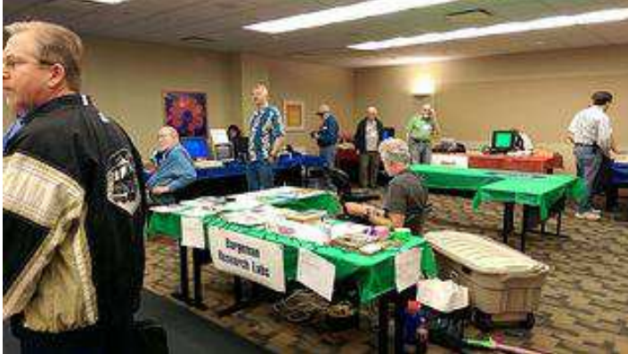
Because we had exhibitors in two rooms last year, some felt they missed half the show. This year we learned to keep all the exhibitors together for better socialization. There was still plenty of room.