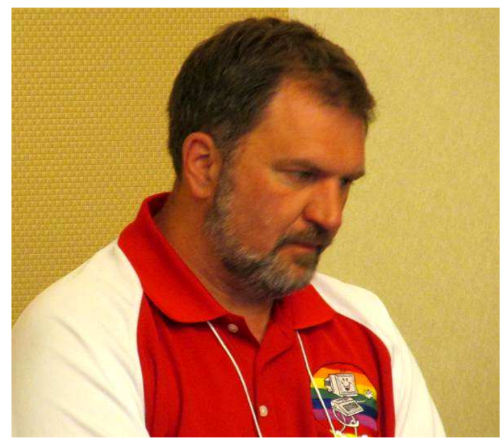
Boisy Pitre informed us that Toolshed had been upgraded to handle function calls – a problem that gave us headaches when we were developing the LogiCall operating system.