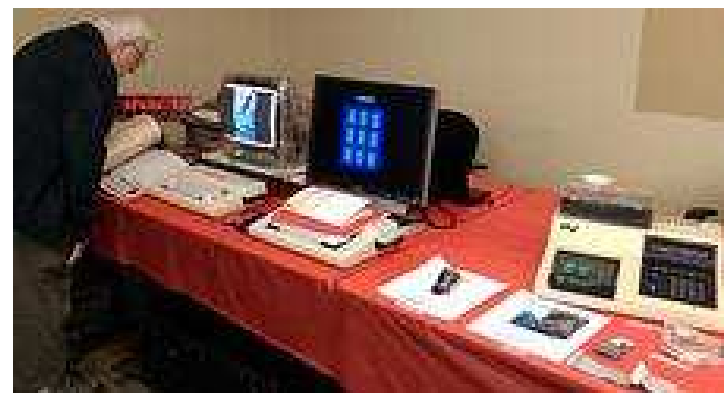
Carl England Sr looking over some of our exhibits.