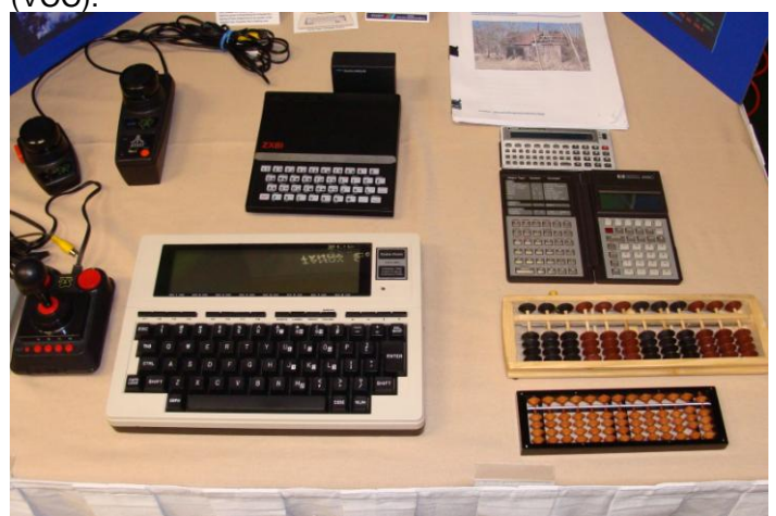
TRS-80 Model 100, and a Sinclair ZX81 w/16K RAM pack. High-viscosity mineral oil must be applied on the connectors of the ZX81 16K RAM pack to prevent crashes and RAM pack burnout. This oil must NEVER be applied to anything rubber like keyboards. It will make anything made of rubber swell, distorting it out of shape.