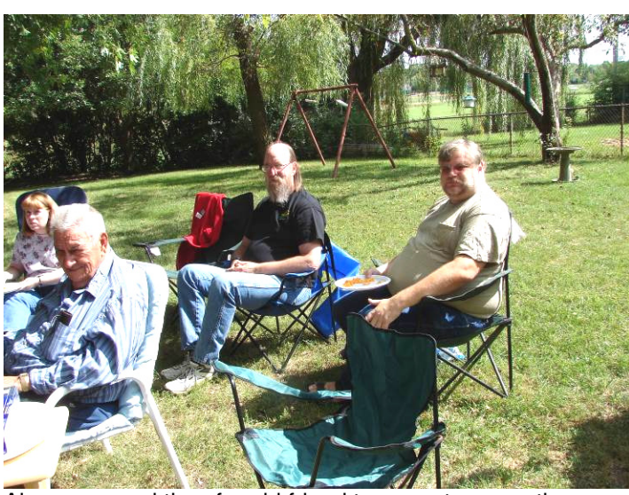
Always a good time for old friend to come to a meeting.