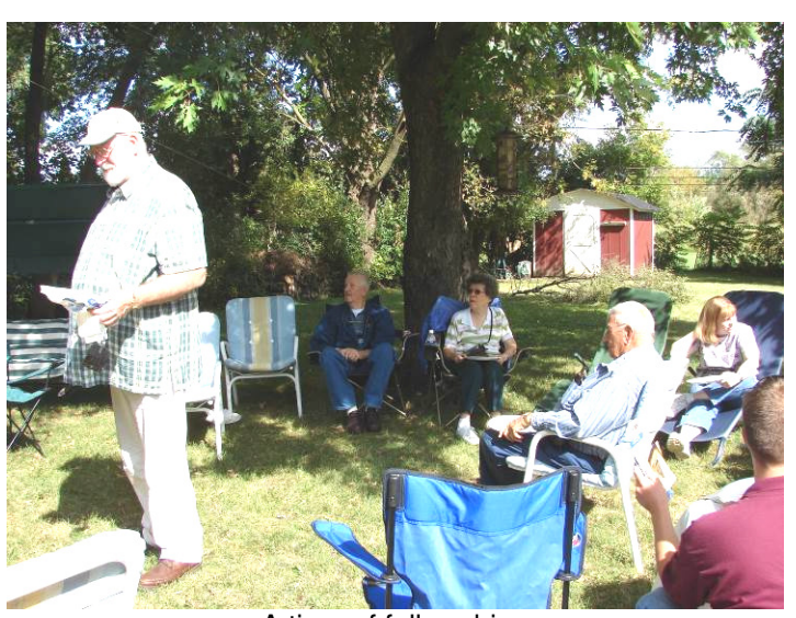
A time of fellowship.