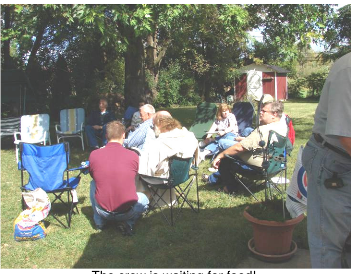
The crew is waiting for food!