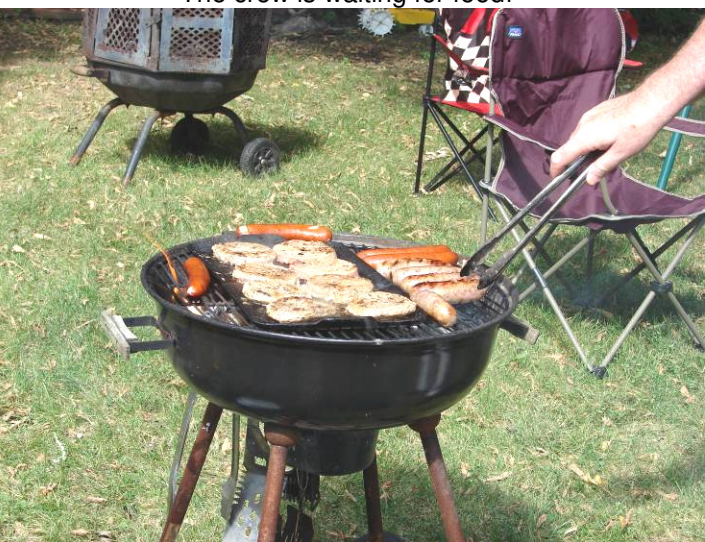
The grill filled with brats, hotdogs and burgers soon to be on the guests' plates.