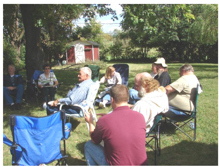
Now begins the wait for the meat to cook to perfection.